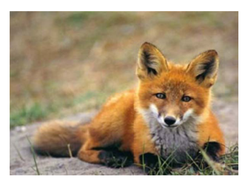
The official mascot of Marist College is the red fox.